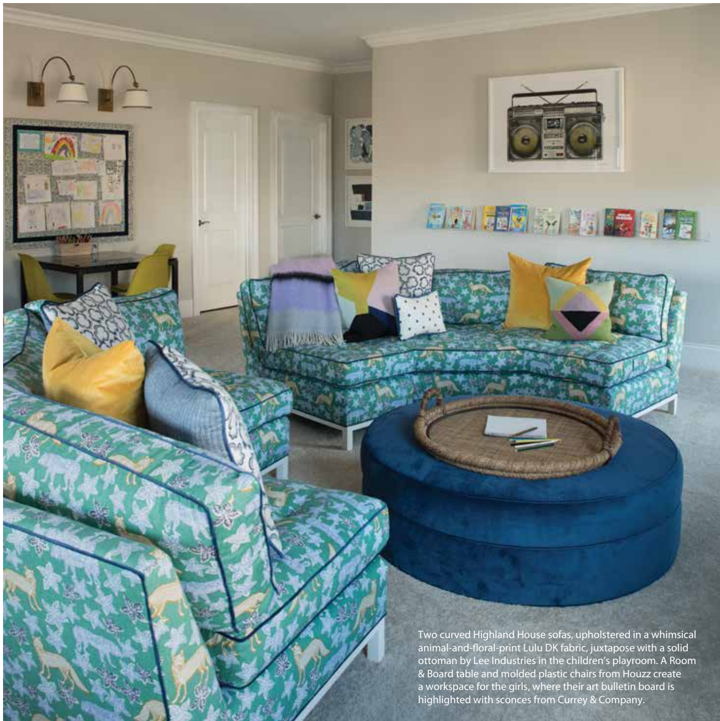
Two curved Highland House sofas, upholstered in a whimsical animal-and-floral-print Lulu DK fabric, juxtapose with a solid ottoman by Lee Industries in the children’s playroom. A Room & Board table and molded plastic chairs from Houzz create a workspace for the girls, where their art bulletin board is highlighted with sconces from Currey & Company.

The older daughter, who was in the tween stage, has a penchant for greys and blues, so the designers devised something