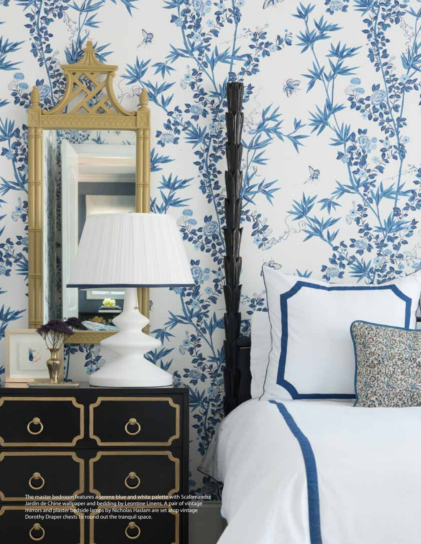
The master bedroom features a serene blue and white palette with Scalamandré Jardin de Chine wallpaper and bedding by Leontine Linens. A pair of vintage mirrors and plaster bedside lamps by Nicholas Haslam are set atop vintage Dorothy Draper chests to round out the tranquil space.